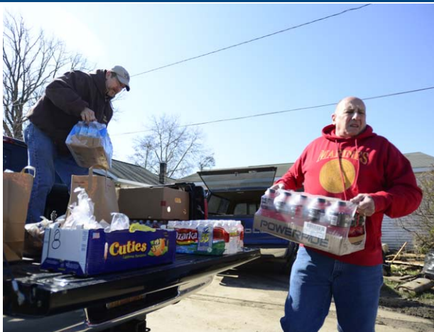
It is important to identify Legion members who can help deliver aid to victims.