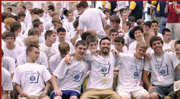
Participants at American Legion Boys State programs develop friendships that will last a lifetime. (Badger Boys State)