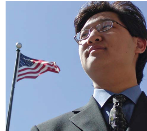
Boys State programs develop leaders for tomorrow.

The selection process for Boys State varies at the state-level organization of The American Legion, but it generally begins with high school educators and/or counselors recommending several young men. The sponsor (either a Legion post or other community organization) then selects representatives from that list to participate in American Legion Boys State.