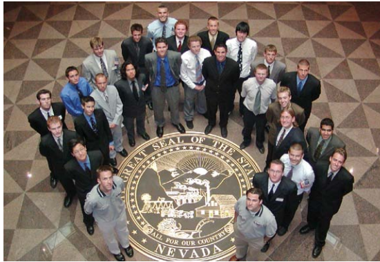
Nevada Boys State visits the Nevada Statehouse.